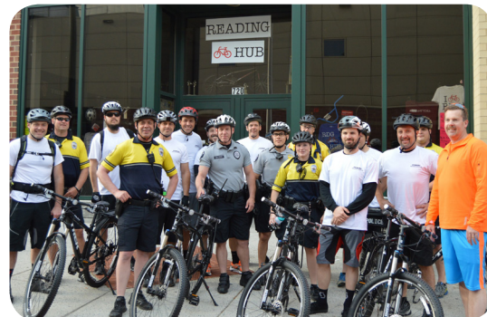
Penske Racing Shocks, Reading Health System and Commuter Services of Pennsylvania help facilitate new police bicycles to law enforcement personnel in the City of Reading and the Borough of West Reading.